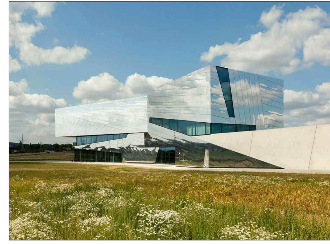
PHOTOGRAPHS SHOWING THE ALUCOBOND CLADDING PANELS AT THE SCHONINGER SPEARS BUILDING (GERMANY) (Paläon, Schöninger Speere)